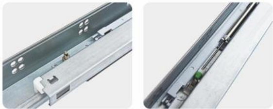
调节螺丝 Adjustment screws 金属阻尼管 Metal damping tube

产品材质: 镀锌板 材料厚度: 1.8x1.5x1.0 mm 额定负重: 35KGS / 18" 标准长度 使用寿命: 超过50000次, 通过SGS疲劳测试 尺寸范围: 12" - 22", 也可根据要求定制 安装方式: 调节钉连接 (可带插销), 无需前置连接件 调节钉调节幅度: 4.5mm (上下调节) 产品特点: 全新优化设计, 配备高精度的生产线和检测仪器 静音系统保证滑动导轨推拉轻松, 顺畅无噪声 Product material: Galvanized sheet Material thickness: 1.8x1.5x1.0 mm Load rating: 35KGS / 18" as standard Cycling: over 50,000 times, pass the SGS fatigue test Size range: 12" - 22", customized is available Installation: Connect with adjustment screws or plastic plug, don't need front connector The adjustment screws adjusting range: 4.5mm ( up and down ) Product feature: Innovative new designed , produced by high accuracy production line and strict measuring, silent system guarantees smooth run without noise.